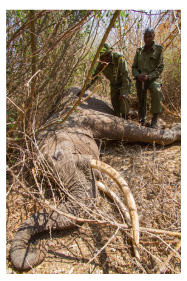
Elephant speared to death on Kuku group ranch (August 25<sup>th</sup>)

On August the 25<sup>th</sup>, Mobile 1 Unit picked up tracks of 4 people following an elephant. While the unit was tracking the suspects, BLF HQ received a call from an informer reporting that the 4 people with spears were stalking an elephant nearby in