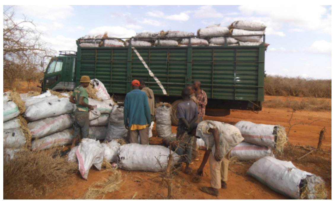
Lorry caught with charcoal on Mbirikani group ranch