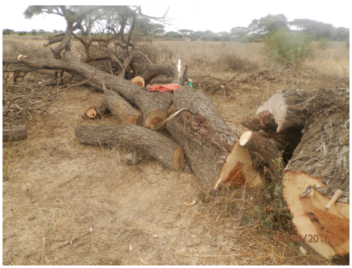
Tree chopped down for wood

BLF rangers responded to 50 incidents of habitat destruction over the reporting period, and a total of 101 people were arrested as a result. The areas most affected are Kimana, Rombo and Ukambani.