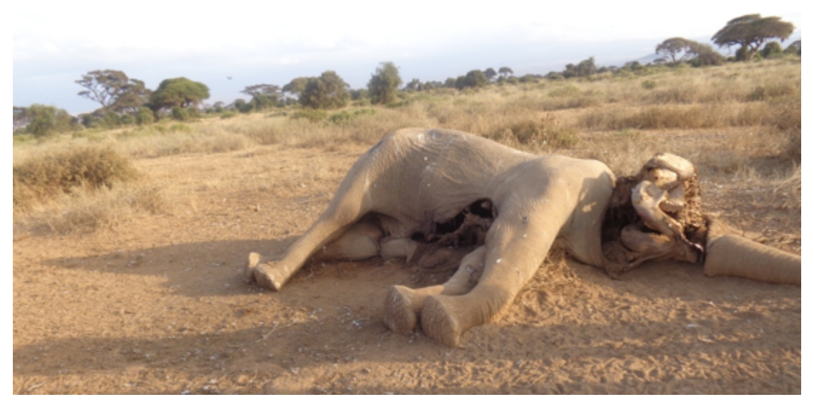
Tusks removed from elephant carcass following natural death

On August the 25<sup>th</sup>, Mobile 1 Unit picked up tracks of 4 people following an elephant. While the unit was tracking the suspects, BLF HQ received a call from an informer reporting that the 4 people with spears were stalking an elephant nearby in