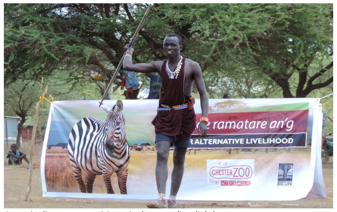
A warrior lines up to participate in the spear (javelin) throw

The first regional competition (Rombo manyatta vs Kuku manyatta) was held on 23/8/2014 at Rombo, followed by competitions between Mbirikani and Olgulului, and Rombo vs Olgulului. The events have been reasonably well attended, with a total of 76 men having come to the events, 224 women, and 644 warriors.